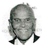
←.....| HARRY BELAFONTE and MIA FARROW On behalf of UNICEF