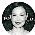
ASHLEY JUDD →.....| Actress and author for her work as the Global Goodwill Ambassador with the United Nations Population Fund