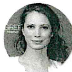
←.....| CHRISTY TURLINGTON BURNS Model, activist and founder of Every Mother Counts; And—for the first time— a community changemaker