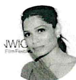
FREIDA PINTO →.....| Advocacy work with Girl Rising