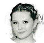
ABIGAIL BRESLIN →.....| On behalf of National Coalition Against Domestic Violence