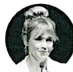
RENÉE ZELLWEGER →.....| Actress and humanitarian for her work on behalf of ALS