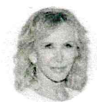
←.....| TRUDIE STYLER Founder of the Rainforest Fund